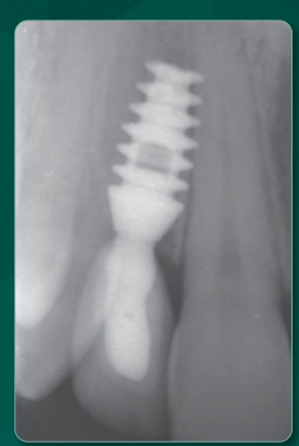
2 Years Post Op