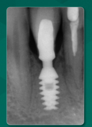
4 Years Post Op