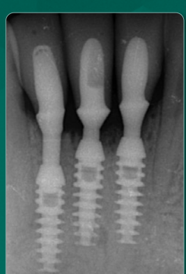
2 Years Post Op