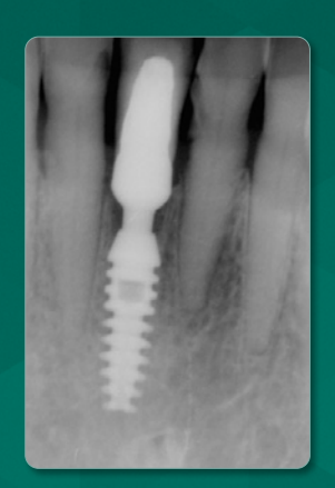
4 Years Post Op