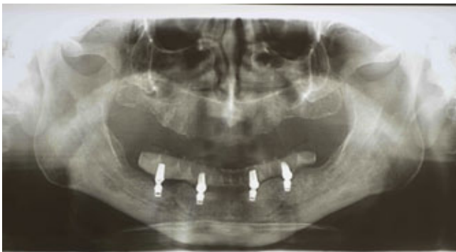
Fig. 5. Radiographical evaluation, note the subcrestal position of implants, the metal-free substructure with denture teeth in position. The opposite dentition in this patient was a complete removable denture.

Another difference concerns bio-tolerability. The reference material (metal alloy) is used despite a lack of robust clinical tolerance studies [36]. Corrosion represents a concrete risk, as cobalt and nickel are released into the oral cavity [37–40], and long-term effects have not yet been fully discovered [1,37,41,42]. The use of a metal-free prosthesis may solve the problems related