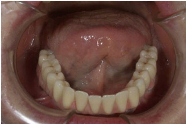
Fig. 4. Intra-oral view, framework is cemented to abutments.

subjected to variable efficacy [28], cause more stress to patients and have longer rehabilitation period.