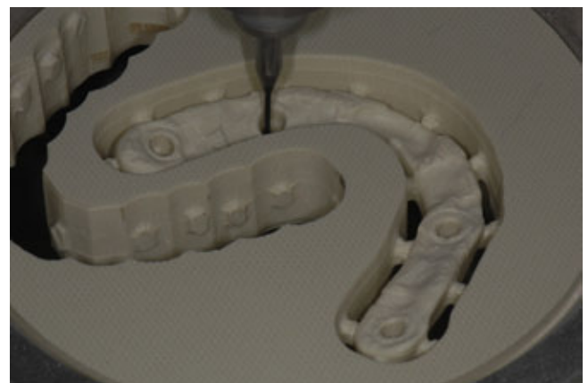
Fig. 3. Fiber-composit disk during milling process. After the digital design, the project is realized through a milling machine.

The first difference from conventional methods is that this procedure limits the indications for bone graft or regeneration, thus using the residual native bone. This is important because horizontal and vertical bone augmentation procedures are