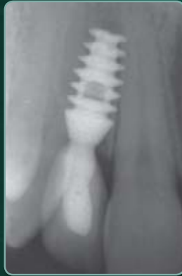
2 Years Post Op