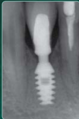
4 Years Post Op