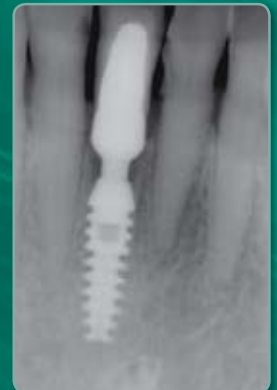
4 Years Post Op