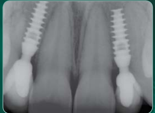
7 Years Post Op